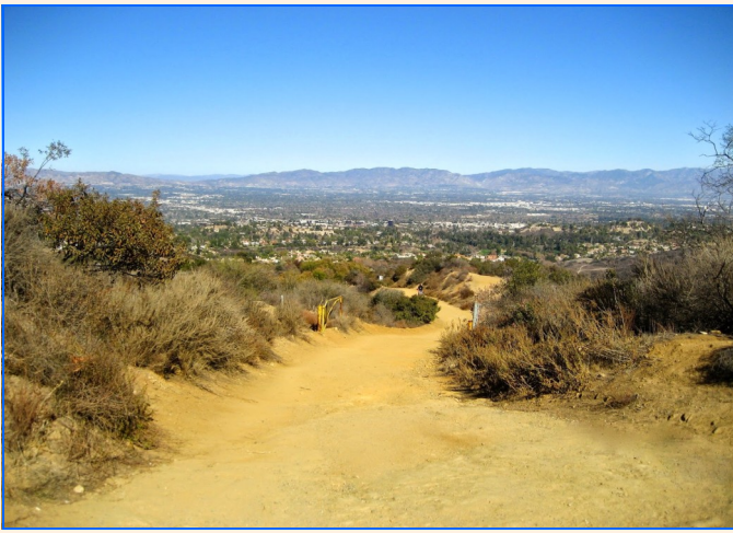
View of the SFV from a hiking trail in the hills above Woodland Hills.

When the lockdown is over, the CWC-SFV will meet once more at the Motion Picture and Television Fund Residential Community in Woodland Hills.