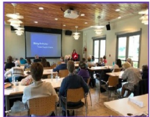
WC-SFV Meeting in the Saban Community Room