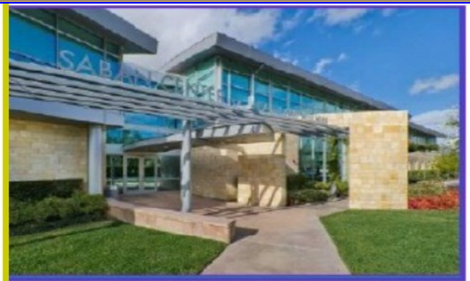
CWC-SFV Meeting Site MPTF Health and Wellness Center

Until then, we'll see you in our Zoom Room at 1 pm on Saturday, September 12.