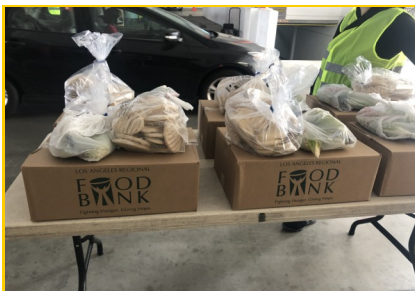
A table of food donations at the L.A. Food Bank, where Jenny is a volunteer.