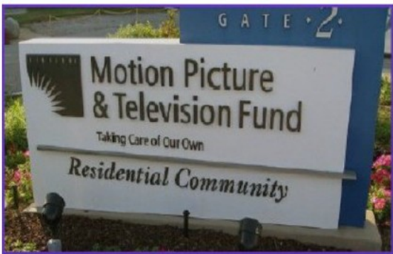
23388 Mulholland Drive Woodland Hills, CA 91364

When the lockdown is over, the CWC-SFV will meet once more at the Motion Picture and Television Fund Residential Community in Woodland Hills.