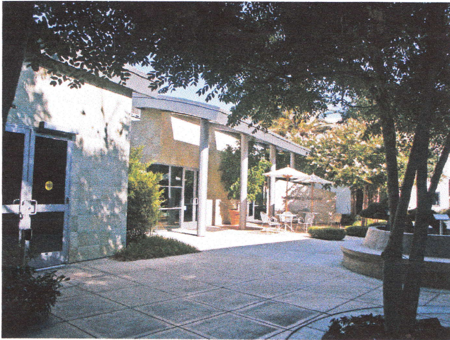
Villa Katzenberg at the Motion Picture and Television Fund home.